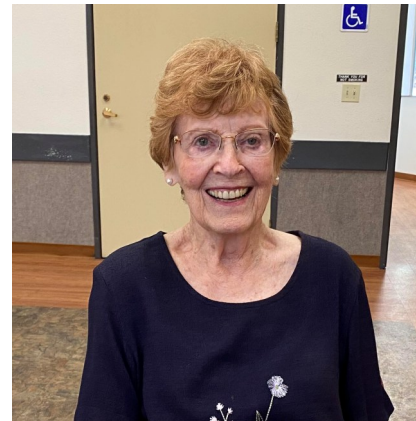
Thank You For All That You Do!!